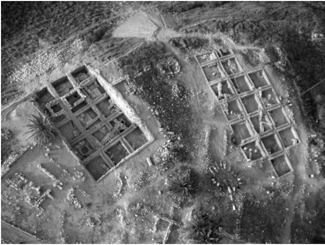
5. Overhead of Areas K and Q at Megiddo, end of the 2008 season. The use of Kenyon-Wheeler 5m x 5m squares in a grid pattern, with one-meter-wide balks between, can be clearly seen.

allowing the stratigraphy of the site to be examined and reexamined as necessary, not only by the original excavators but by subsequent archaeologists as well.